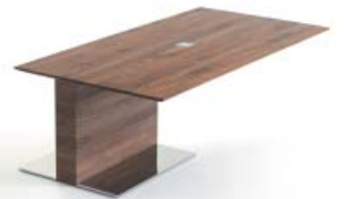
metal base plate in stainless steel polished or brushed finish